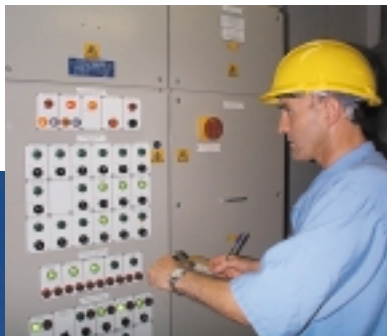
Part of the control suite.

Corporate Communications, D2003, Zone 9, Dounreay, Thurso, Caithness, KW14 7TZ. Telephone 01847 806080 Facsimile 01847 806900