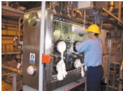
Manual adjustment of process.