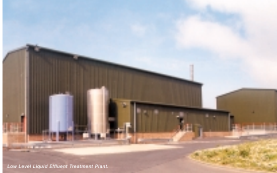
Low Level Liquid Effluent Treatment Plant.

Effluent from the Low Active Drain system flows into the gravity receipt/solvent separator tank. The tank is below ground level to allow effluent to flow continuously from drain lines by gravity. Effluent arrives periodically from PFR, Vulcan, Fuel Cycle Area and other sources.