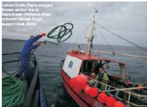
Callum Smith (Fathoms skipper) anchors anchor line to Dave Green (Fathoms diver) onboard George King's support boat, Anita

Following the offshore work, undertaken by Fathoms in 2008, a review of the programme to cover approximately 60 hectares in the main plume was carried out. To allow time to develop experience in the operation of the retrieval system, it is expected that 7.5 hectares would be covered in 2009, followed by 12.5 hectares, 20 hectares and 22 hectares in subsequent years.